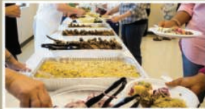
A great (free) dinner