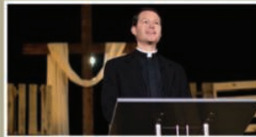
An engaging video message