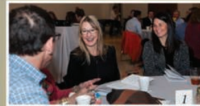
Conversation about the message

Discovering Christ: A 7-week experience Wednesday Evenings starting Sep 24 with a Sunday Half-Day Retreat on Oct 26 Event at Epiphany Parish, more details coming.